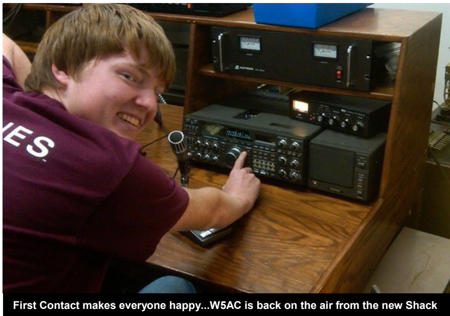
First Contact makes everyone happy...W5AC is back on the air from the new Shack